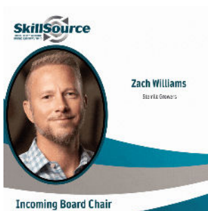
Incoming Board Chair

Over the past year we have been gathering data and input to inform the 2024 - 2028 Strategic Plan. Our writing team has been hard at work crafting the goals of our region and updating the draft of the plan. We're looking forward to sharing the draft with you in our March committee meetings.