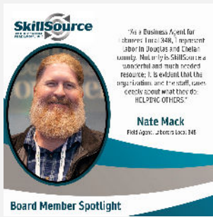
Board Member Spotlight