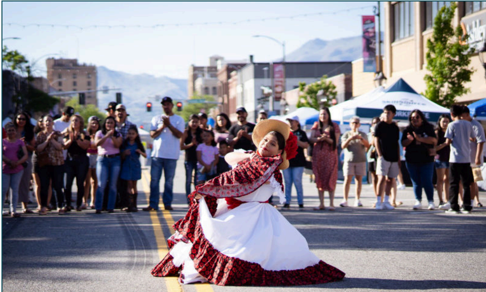
SkillSource was the Diamond Sponsor for Wenatchee's La Terraza de Main Street on May 11.

SERVING CHELAN, DOUGLAS, GRANT, ADAMS, OKANOGAN COUNTIES